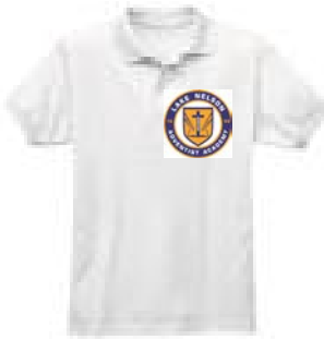
Boys/Girls White Knit Shirt with logo blue /or gold logo